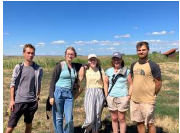
Picture 8: Five of the seven DO-G awardees in Hortobágy National Park.