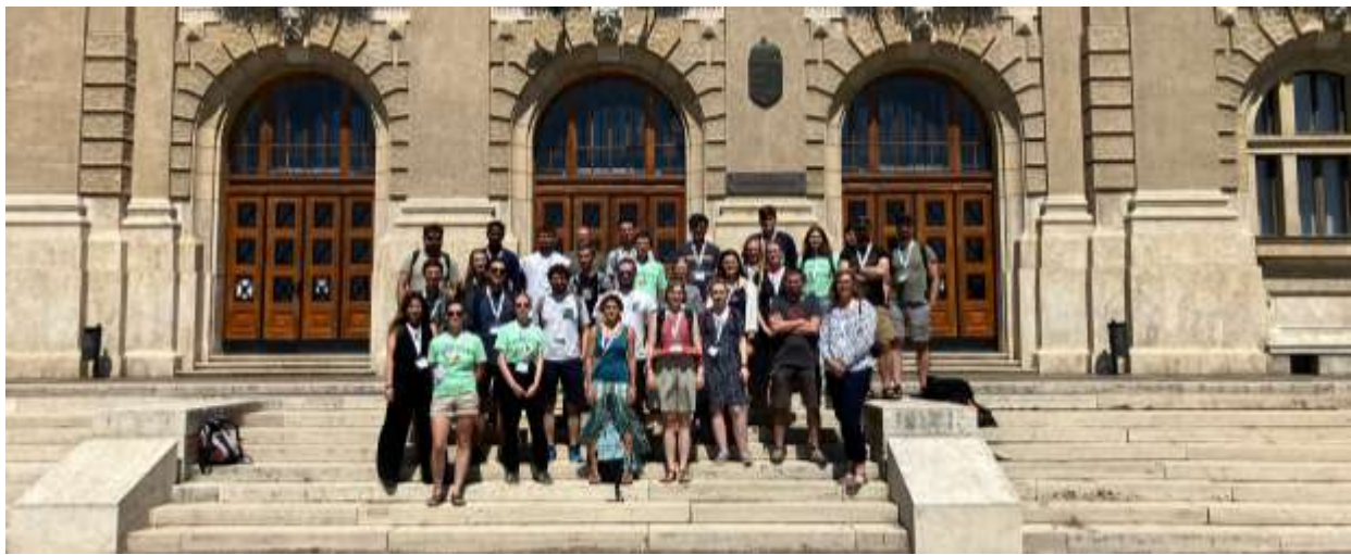
Picture 1: Participants front of the main building of University of Debrecen.

This year (2022), after a long covid break, we were lucky to organize the first in-person conference related to the EOU since the regular conference in Cluj-Napoca, 2019. There were 33 participants at the conference, including four local organizers and four plenary speakers, coming from 14 different countries.