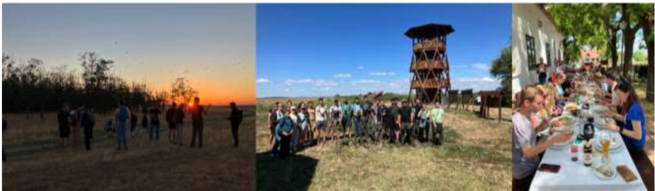
Picture 2: Fledglings in the Hortobágy National Park for birding and in the Hortobágy Inn trying Hungarian cuisine.

We started the conference with an excursion to Hortobágy National Park. We departed from Debrecen at 4:30 am and finished our birding trip at 11:00 am. We spotted 84 species during our trip. You may find our species list here: https://ebird.org/tripreport/72361 . After the birding trip, we made a short stop in Hortobágy Inn to try traditional Hungarian cuisine for lunch.