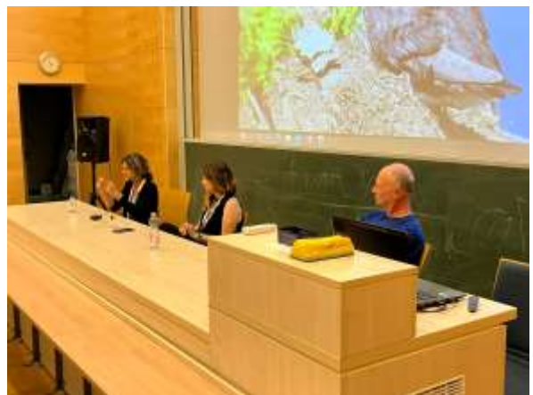
Figure 6: Plenary speakers during the round-table discussion.